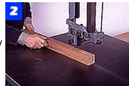
Mark the taper on two faces of each leg, then cut the tapers on a band saw. Stay on the waste side of the pencil line.