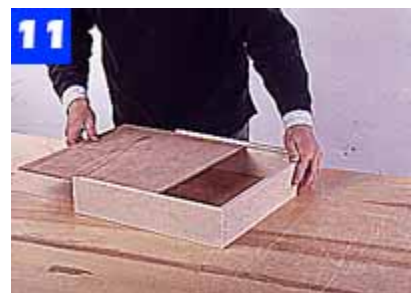
Cut the plywood drawer bottom to size. Once the glue has cured, slide the drawer bottom into its groove.

Rip and crosscut the drawer box pieces and the bottoms, then cut the rabbets and grooves in them using a dado blade in a table saw. Drill 1/16-in.-dia. pilot holes in the drawers ( Photo 10 ). Slide each bottom into its groove ( Photo 11 ).