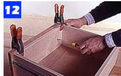
Clamp the drawer front to the drawer box, bore pilot holes, and attach the front with flathead screws.

Cut drawer faces to size and install them ( Photo 12 ). Install a knob on each drawer face. Install the drawers, and adjust the slides so the drawers have a uniform 1/16-in. margin on all sides. Remove the drawers from the table and remove the knobs and slides before finishing. Sand all surfaces with 120-, 150-, 180- and 220-grit sandpaper. Dust off the surfaces completely between grits.