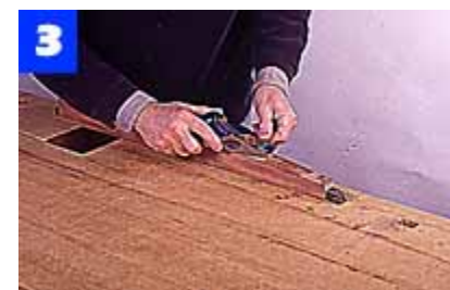
Clamp each leg to the workbench top. Next, use a block plane to remove saw marks and refine the leg taper.