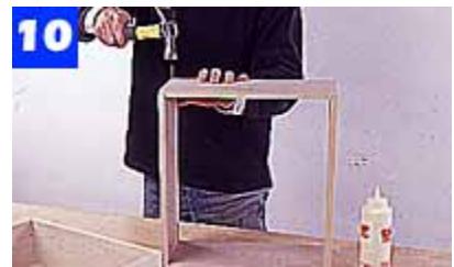
The drawer box is built with rabbeted and grooved pieces. Assemble the box with glue and finishing nails.

Gently plane the edge banding flush to the top after the glue has cured, and cut the molding on the edge banding with a router and cove bit. We used a shallow-cutting cove bit (Item No. 387, MLCS, Box 4053/C-24, Rydal, PA 19046; 800-533-9298). Cut joining-plate slots in the bottom of the tabletop, and then glue and clamp the top to the table base using standard plate-joining procedure.