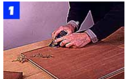
Glue and clamp strips of mahogany to the plywood panel edges, and then trim them flush to the panel with a block plane.

Rip and crosscut the table legs, and mark their tapered profiles. Use a band saw to cut the legs to shape ( Photo 2 ). Clamp each leg to the workbench, then use a block plane to remove saw marks ( Photo 3 ).