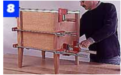
Use bar clamps at the location of each joining plate to evenly distribute pressure when assembling the table case.

Cut the plywood panel for the table's top, and prepare the edge banding. Cut miters on the ends of two pieces of edge banding so they correspond to the dimensions of the top, and then glue and clamp these to the top. Cut mitered ends on the remaining edge banding, then glue and clamp these to the top ( Photo 9 ).